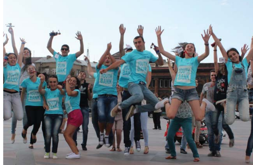
Youth Bank Meeting

"The Youth Bank (YB) idea is to recruit 7 to 9 volunteers (aged 16-21) in a particular community and to develop their capacity to identify, fund, and oversee small projects that are initiated by their peers. There are 25 Youth Bank Committees throughout Georgia, including across the administrative boundary line (ABL) in Abkhazia. The annual YB statistics are impressive: over 300 project proposals involving more than 1,000 young people were submitted to the 25 Youth Banks operating throughout Georgia. Moreover, the Youth Bank volunteers funded and oversaw over 60 youth-led initiatives, as well as mobilized more than four local municipalities and businesses to make in-kind or financial contributions to youth-led initiatives. These impressive statistics notwithstanding, I am most excited when I see how the lives of the Program beneficiaries have changed, as their participation in the Youth Banks boosts their employment skills, self-esteem, and motivation to engage in public life. I will never forget the sparkling eyes of the young people from Keda, Khulo, and Shuakhevi, the mountainous regions of Adjara, when they were selected as Youth Bank committee members, happy to be given the opportunity to learn