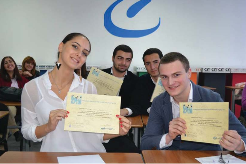
Competition - Students for Social Enterprise